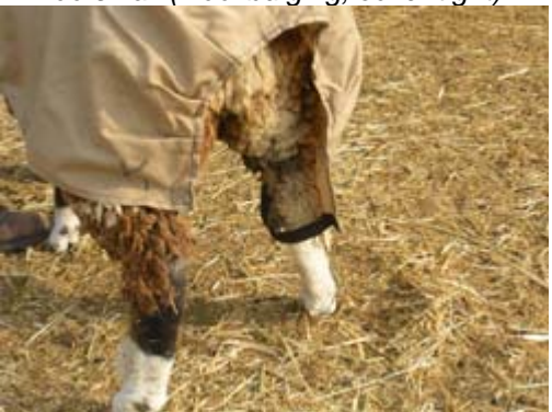
Too Large (straps hang below hock, cover hangs unevenly).