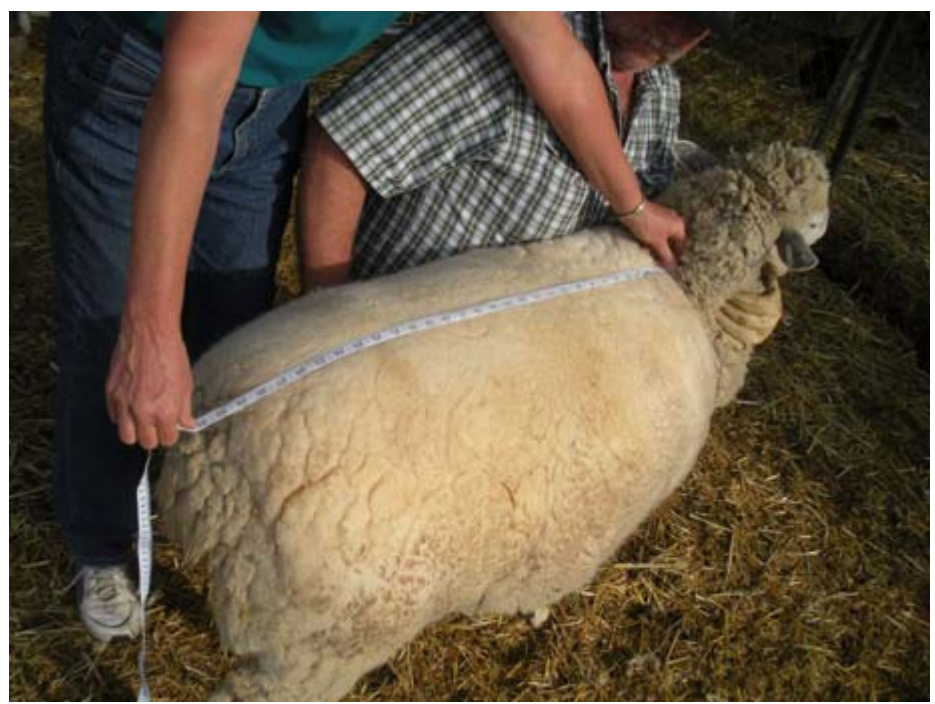
Cloth sewing tape is the best and easiest for measuring: Metal tape noise and stiffness worry sheep. Start at neck's base. Push the tape into the wool to meet the neck. Rest tape lightly atop the wool (we're trying to cover wool volume. Measure to the wool end, not just to the dock. Always round UP to the next size. Covers too small may cause felting. Covers too large (within reason) can be made smaller by using a basting stitch to make a seam down the back, raising leg straps above the sheep's hock.