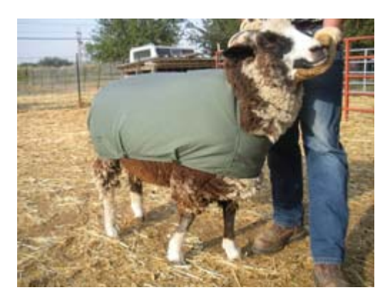
Too small (wool bulging, cover tight).

"It's about impossible to remove vegetable matter by hand," he said. "In a commercial operation it's not so much of a problem because they probably carbonize the vegetable matter with a mild acid."