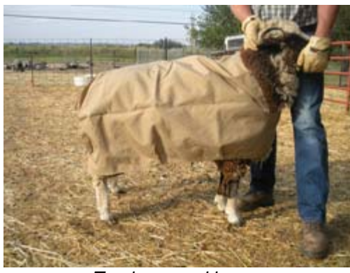
Too large and loose.

Rocky Sheep Suits come in two types of fabrics. There is a heavy nylon suit made from the material used in tough backpacks and other durable out door products.