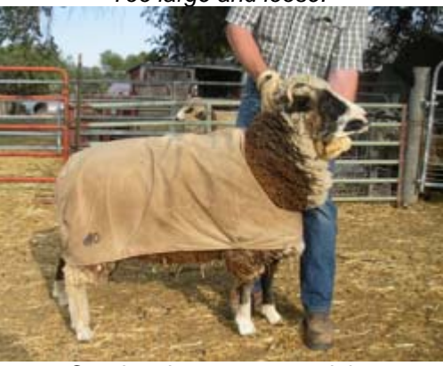
Good and snug; not too tight.